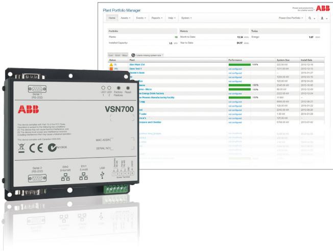
VSN700 Data Logger and web user interface