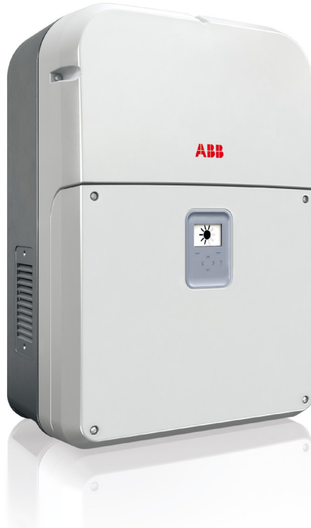
ABB string inverters cost-efficiently convert the direct current (DC) generated by solar modules into high quality three-phase alternating current (AC) that can be fed into the power distribution network (i.e. grid). Designed to meet the needs of the entire supply chain – from system integrators and installers to end users – these transformerless, three-phase inverters are designed for decentralized photovoltaic (PV) systems installed in commercial and industrial systems up to megawatt (MW) sizes.